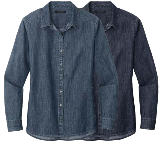
PORT AUTHORITY Ladies Long Sleeve Perfect Denim Shirt LW676 Women's Sizes: XS-4XL | 2 colors