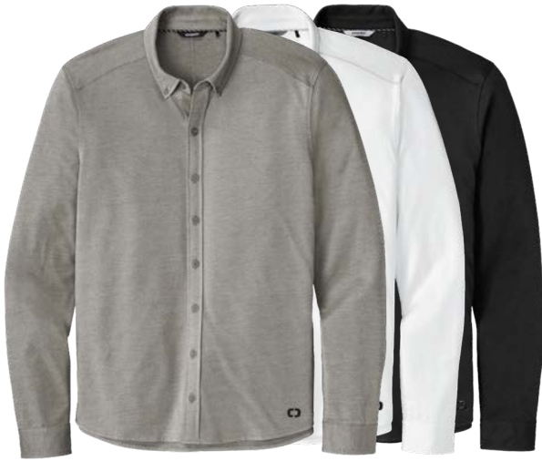
OGIO Code Stretch Long Sleeve Button-Up OG145 Adult Sizes: XS-4XL | 3 colors