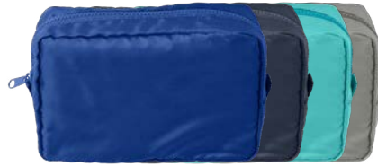
PORT AUTHORITY Stash Dimensional Pouch BG916 6 colors