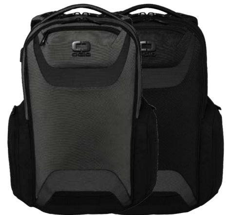
OGIO Connected Pack 91008 2 colors