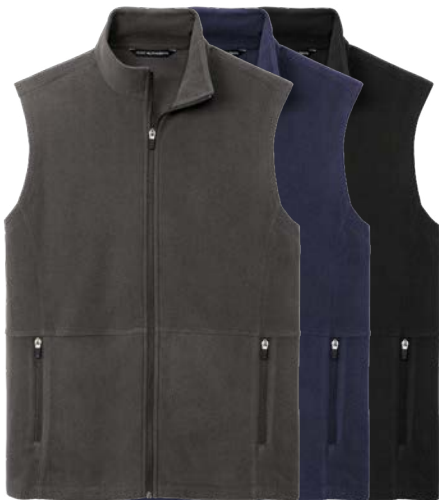
PORT AUTHORITY Accord Microfleece Vest F152 Adult Sizes: XS-4XL | 3 colors