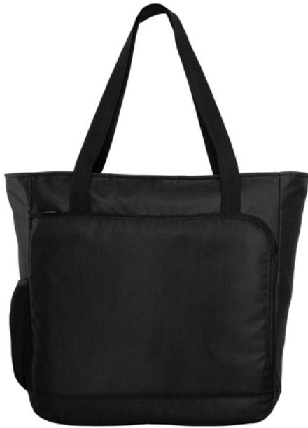
PORT AUTHORITY City Tote BG422 1 color