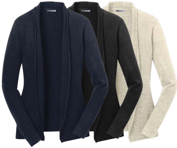
PORT AUTHORITY Ladies Open Front Cardigan Sweater LSW289 Women's Sizes: XS-4XL | 4 colors