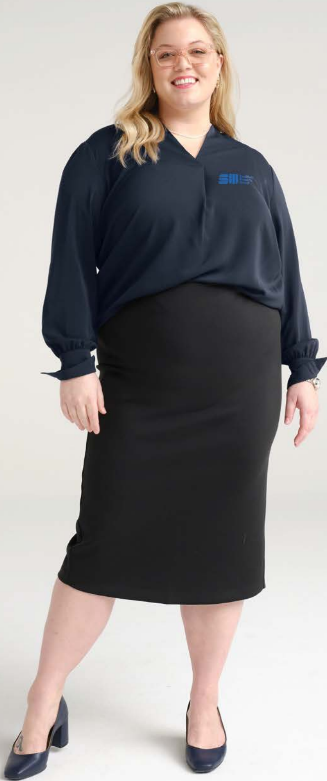
BROOKS BROTHERS Women's Open-Neck Satin Blouse BB18009 Women's Sizes: XS-4XL | 4 colors

Buttoned-up should not mean boring. A true classic look brings the team together with a sense of professionalism and pride.