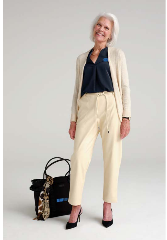
BROOKS BROTHERS Wells Laptop Tote BB18840 2 colors Worn with BB18009, LSW289