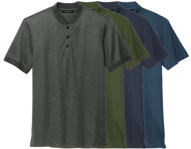
MERCER + METTLE Stretch Pique Henley MM1008 Adult Sizes: XS-4XL | 7 colors