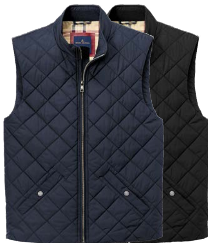
BROOKS BROTHERS Quilted Vest BB18602 Adult Sizes: XS-4XL | 2 colors