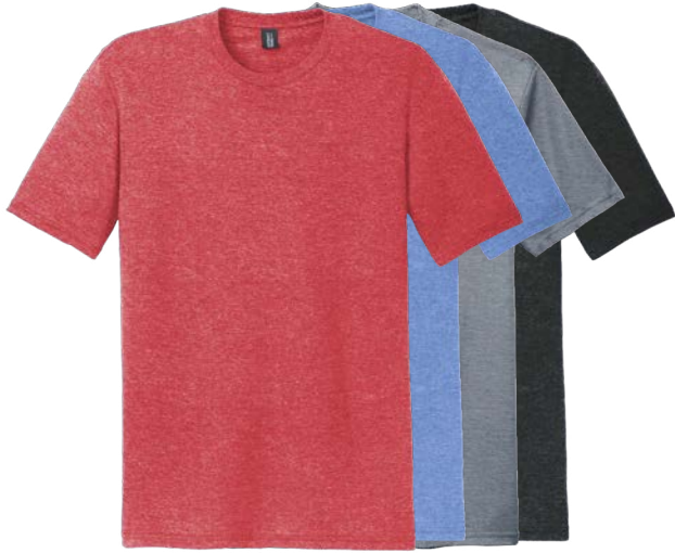
DISTRICT Perfect Tri Tee DM130 Adult Sizes: XS-4XL | 35 colors