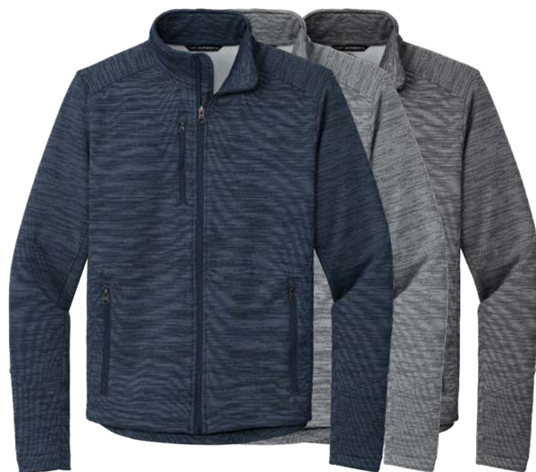
PORT AUTHORITY Digi Stripe Fleece Jacket F231 Adult Sizes: XS-4XL | 3 colors