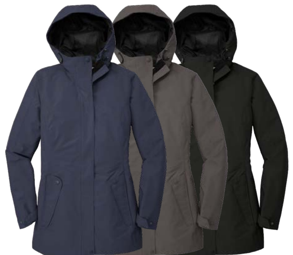
PORT AUTHORITY Ladies Collective Outer Shell Jacket L900 Women's Sizes: XS-4XL | 4 colors