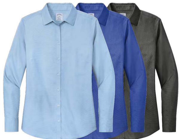
BROOKS BROTHERS Wrinkle Free Women's Stretch Nailhead Shirt BB18003 Women's Sizes: XS-4XL | 6 colors