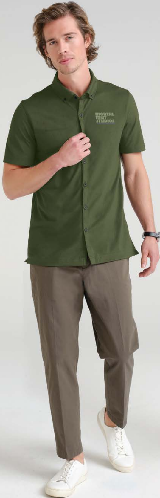
MERCER + METTLE Stretch Pique Full-Button Polo MM1006 Adult Sizes: XS-4XL | 7 colors