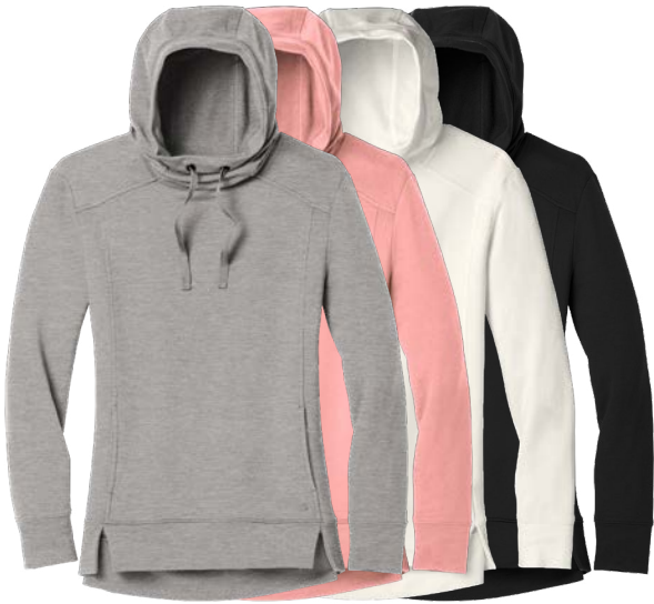
OGIO Ladies Luuma Pullover Fleece Hoodie LOG810 Women's Sizes: XS-4XL | 4 colors