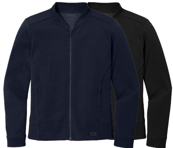
OGIO Ladies Hinge Full-Zip LOG820 Women's Sizes: XS-4XL | 3 colors