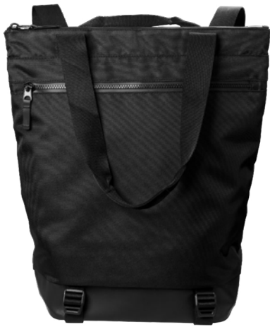
MERCER + METTLE Convertible Tote MMB202 1 color