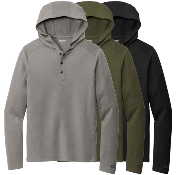
OGIO Luuma Flex Hooded Henley OG826 Adult Sizes: XS-4XL | 3 colors