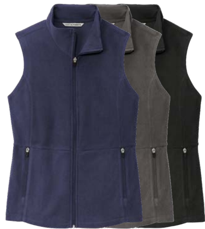
PORT AUTHORITY Ladies Accord Microfleece Vest L152 Women's Sizes: XS-4XL | 3 colors