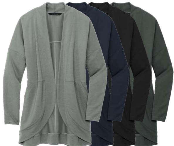
MERCER + METTLE Women's Stretch Open-Front Cardigan MM3015 Women's Sizes: XS-4XL | 4 colors