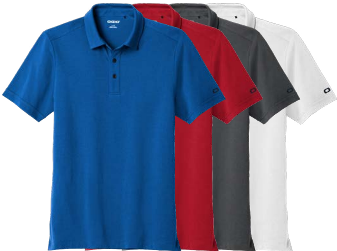
OGIO Limit Polo OG138 Adult Sizes: XS-4XL | 6 colors