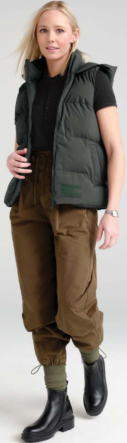
MERCER + METTLE Women's Stretch Heavyweight Pique Polo MM1001 Women's Sizes: XS-4XL | 8 colors