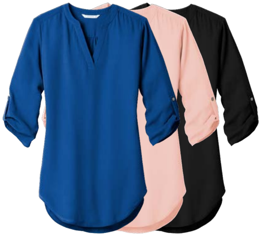
PORT AUTHORITY Ladies 3/4-Sleeve Tunic Blouse LW701 Women's Sizes: XS-4XL | 8 colors

Uplift the whole team with outfits that speak to a cohesive vision, a laid-back attitude and a clear focus on accomplishing great work together.