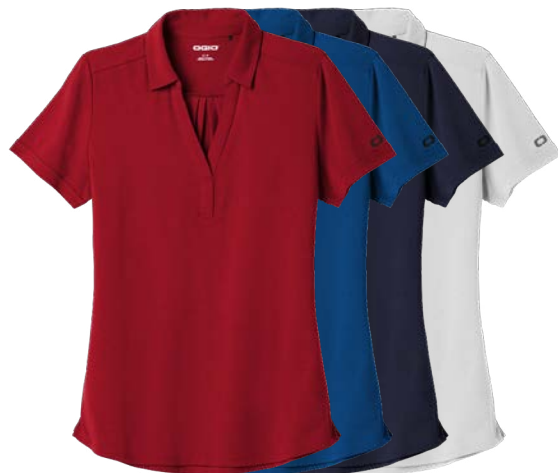
OGIO Ladies Limit Polo LOG138 Women's Sizes: XS-4XL | 7 colors