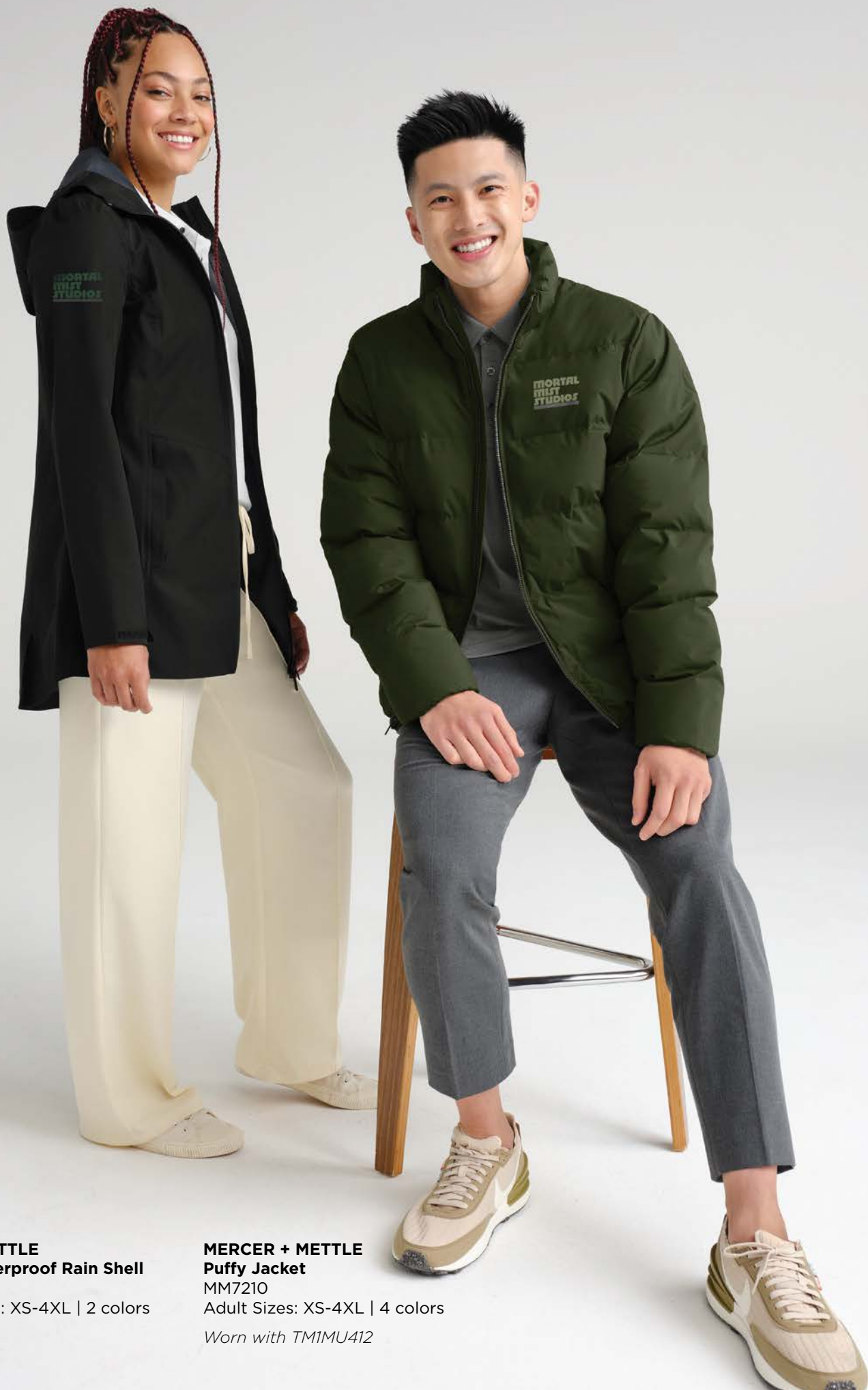
MERCER + METTLE Women's Waterproof Rain Shell MM7001 Women's Sizes: XS-4XL | 2 colors