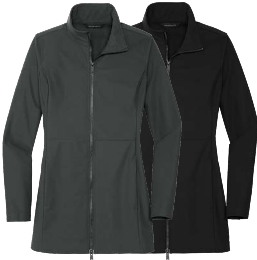
MERCER + METTLE Women's Faillé Soft Shell MM7101 Women's Sizes: XS-4XL | 2 colors