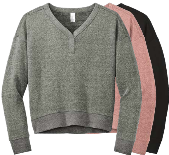
DISTRICT Ladies Perfect Tri Fleece V-Neck Sweatshirt DT1312 Women's Sizes: XS-4XL | 5 colors