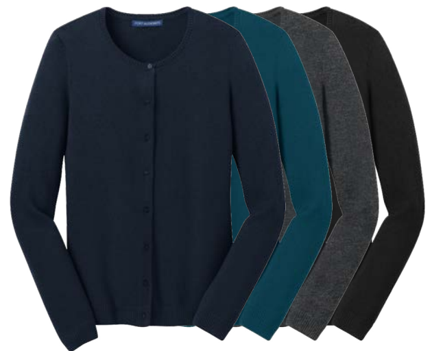
PORT AUTHORITY Ladies Cardigan Sweater LSW287 Women's Sizes: XS-4XL | 3 colors