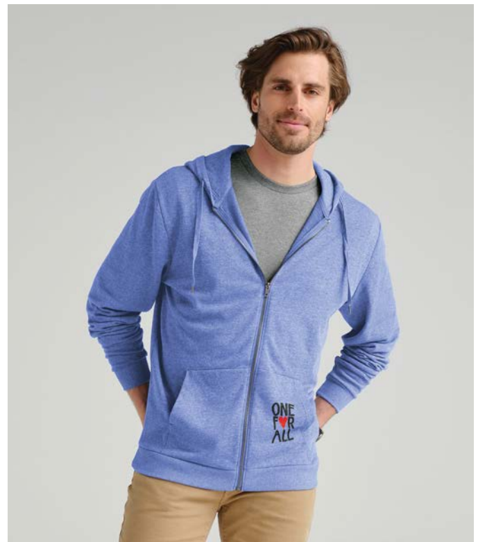
DISTRICT Perfect Tri Fleece Full-Zip Hoodie DT1302 Adult Sizes: XS-4XL | 6 colors Worn with DM130