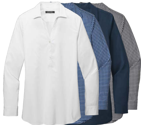
PORT AUTHORITY Ladies City Stretch Tunic LW680 Women's Sizes: XS-4XL | 5 colors