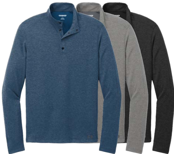
OGIO Command 1/4-Snap OG151 Adult Sizes: XS-4XL | 3 colors