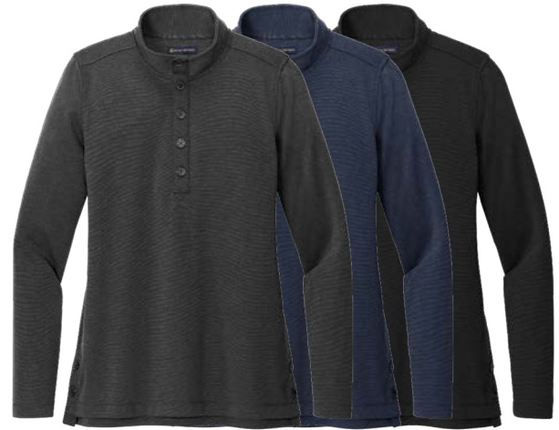
BROOKS BROTHERS Women's Mid-Layer Stretch 1/2 Button BB18203 Women's Sizes: XS-4XL | 3 colors