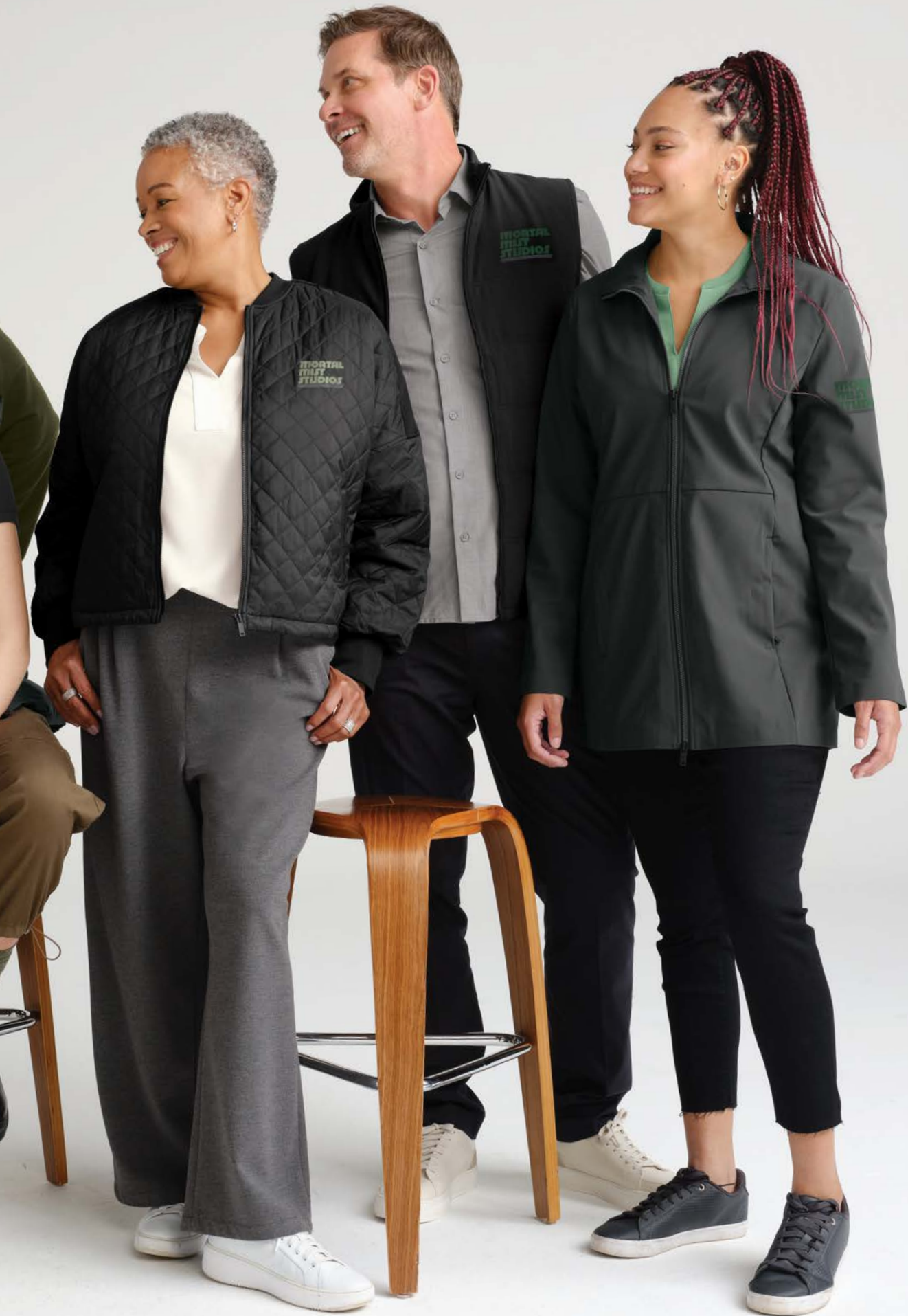
LEFT TO RIGHT: MM1006 MM3000 OG826 MM1001 MM7217 MM7201 MM2011 MM2000 TMIMW453 MM7101 MM2011