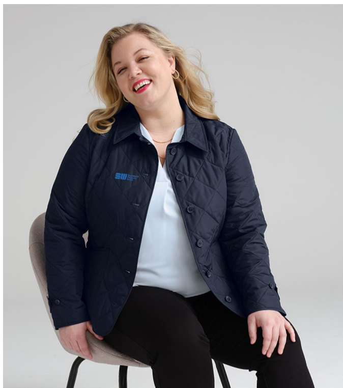
BROOKS BROTHERS Women's Quilted Jacket BB18601 Women's Sizes: XS-4XL | 2 colors Worn with BB18009