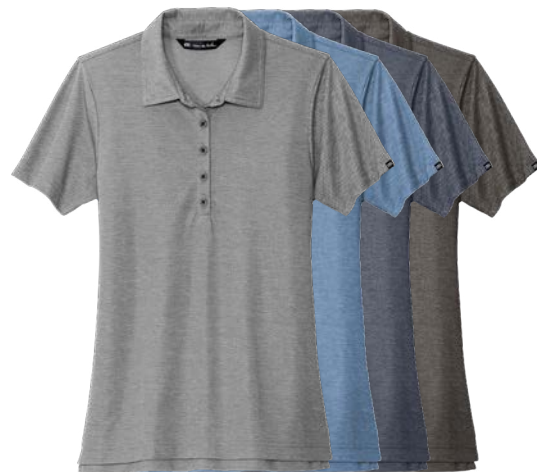
TRAVISMATHEW Ladies Oceanside Heather Polo TM1WW002 Women's Sizes: S-2XL | 6 colors