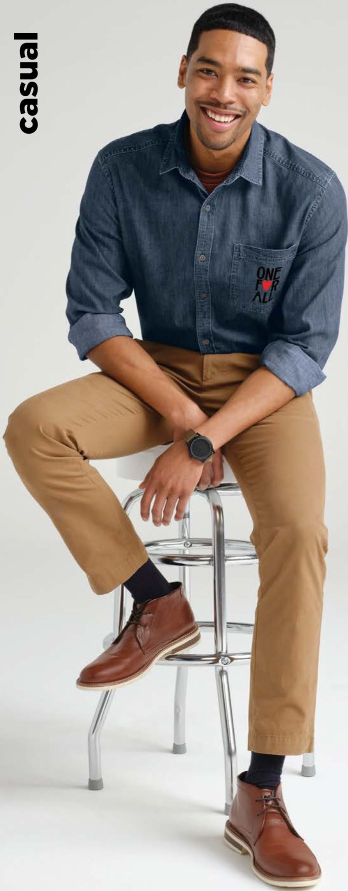
PORT AUTHORITY Long Sleeve Perfect Denim Shirt W676 Adult Sizes: XS-4XL | 2 colors