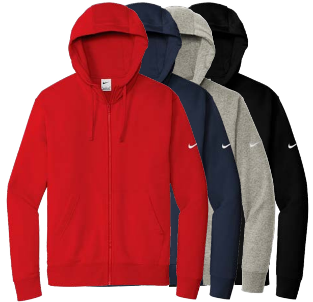
NIKE Club Fleece Sleeve Swoosh Full-Zip Hoodie NKDR1513 Adult Sizes: XS-4XL | 6 colors