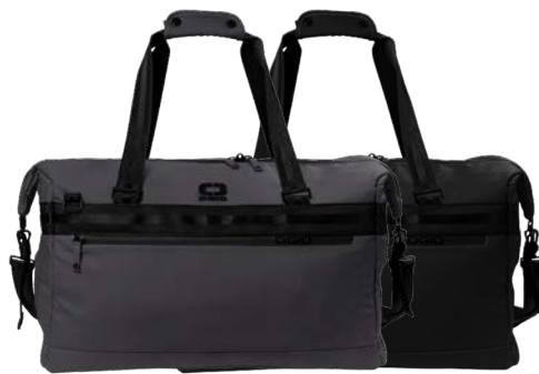
OGIO Commuter Duffel 411098 2 colors