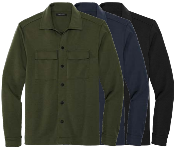
MERCER + METTLE Double-Knit Snap Front Jacket MM3004 Adult Sizes: XS-4XL | 3 colors