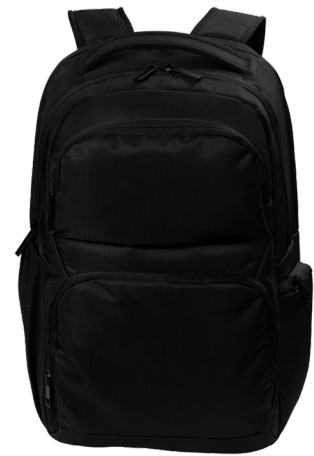
PORT AUTHORITY Transit Backpack BG224 1 color