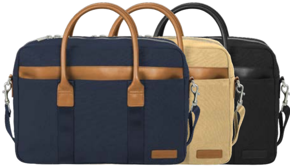
BROOKS BROTHERS Wells Briefcase BB18830 3 colors