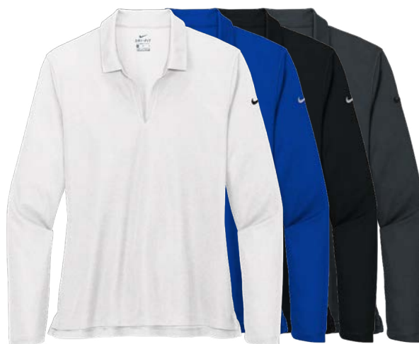
NIKE Ladies Dri-FIT Micro Pique 2.0 Long Sleeve Polo NKDC2105 Women's Sizes: S-2XL | 7 colors