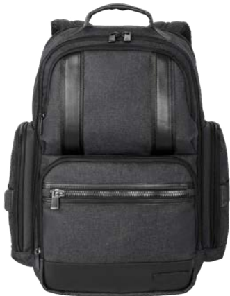
BROOKS BROTHERS Grant Backpack BB18820 1 color