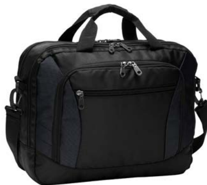
PORT AUTHORITY Commuter Brief BG307 1 color