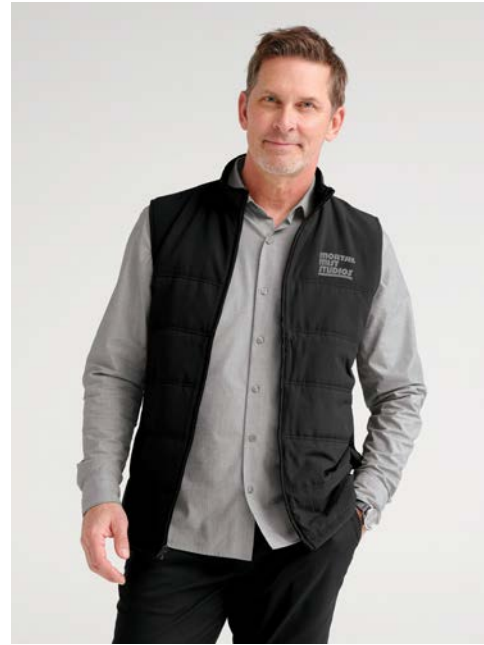
TRAVIS MATHEW Cold Bay Vest TM1MW453 Adult Sizes: S-3XL | 2 colors Worn with MM2000