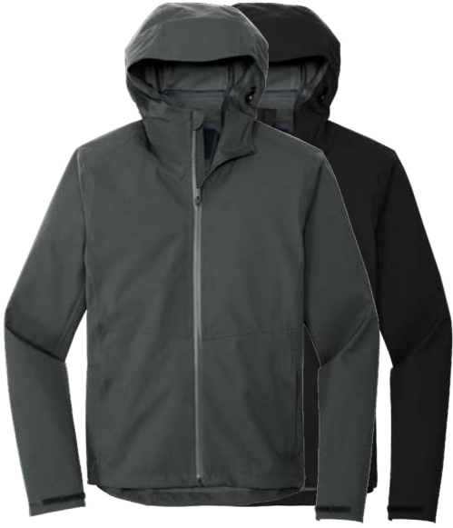
MERCER + METTLE Waterproof Rain Shell MM7000 Adult Sizes: XS-4XL | 2 colors