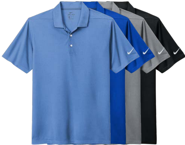
NIKE Dri-FIT Micro Pique 2.0 Polo NKDC1963 Adult Sizes: XS-4XLT | 20 colors