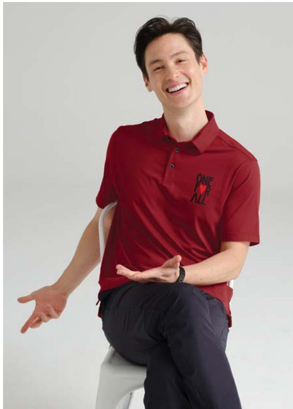
PORT AUTHORITY City Stretch Polo K682 Adult Sizes: XS-4XL | 6 colors