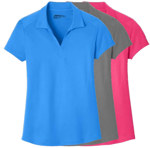
NIKE Ladies Dri-FIT Legacy Polo 838957 Women's Sizes: XS-2XL | 6 colors