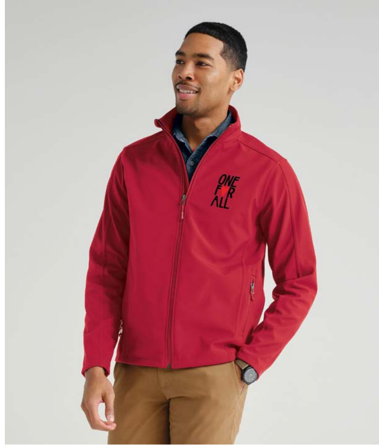
PORT AUTHORITY Core Soft Shell Jacket J317 Adult Sizes: XS-6XL | 11 colors Worn with W676