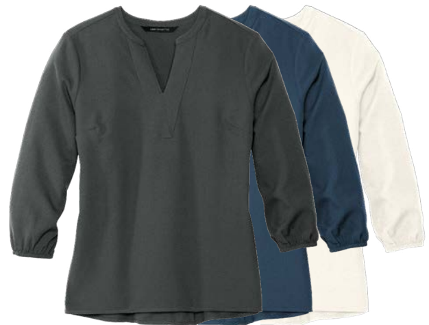
MERCER + METTLE Women's Stretch Crepe 3/4-Sleeve Blouse MM2011 Women's Sizes: XS-4XL | 5 colors