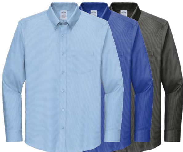
BROOKS BROTHERS Wrinkle Free Stretch Nailhead Shirt BB18002 Adult Sizes: XS-4XL | 6 colors