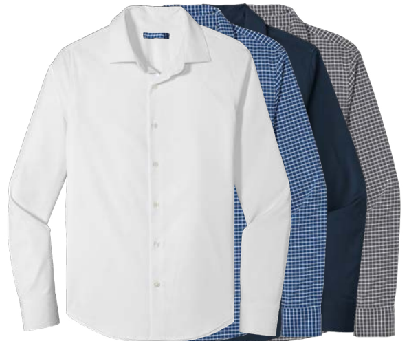
PORT AUTHORITY City Stretch Shirt W680 Adult Sizes: XS-4XL | 5 colors