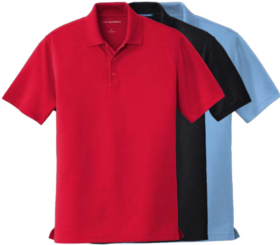
PORT AUTHORITY Dry Zone UV Micro-Mesh Polo K110 Adult Sizes: XS-6XL | 16 colors