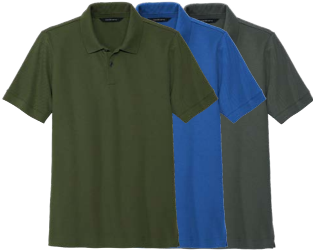
MERCER + METTLE Stretch Heavyweight Pique Polo MM1000 Adult Sizes: XS-4XL | 8 colors