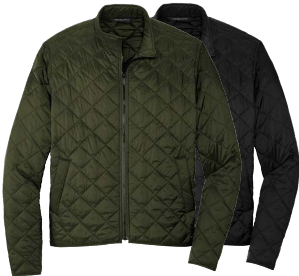
MERCER + METTLE Quilted Full-Zip Jacket MM7200 Adult Sizes: XS-3XL | 2 colors