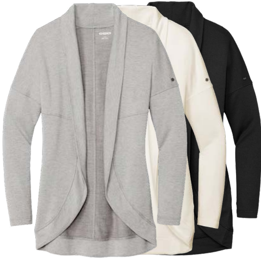
OGIO Ladies Luuma Coccoon Fleece LOG811 Women's Sizes: XS-4XL | 3 colors