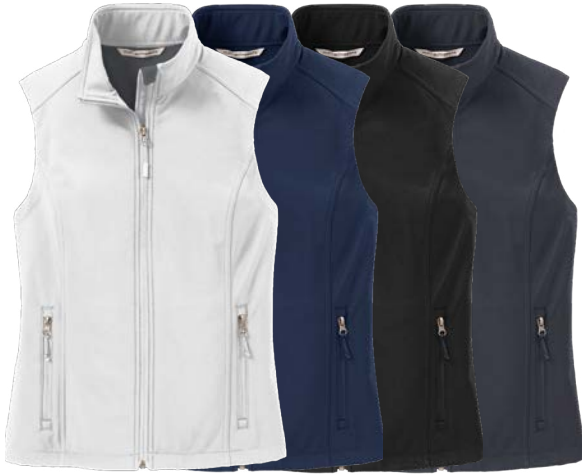
PORT AUTHORITY Ladies Core Soft Shell Vest L325 Women's Sizes: XS-4XL | 5 colors