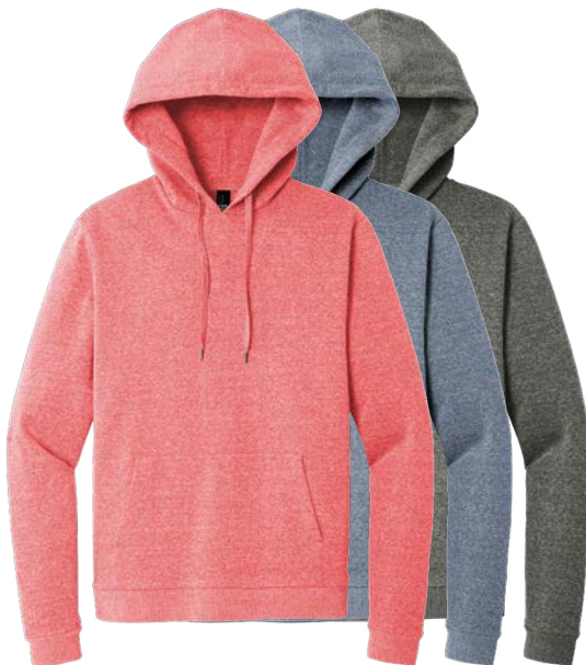
DISTRICT Perfect Tri Fleece Pullover Hoodie DT1300 Adult Sizes: XS-4XL | 12 colors