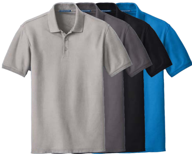
PORT AUTHORITY Core Classic Pique Polo K100 Adult Sizes: XS-6XL | 12 colors