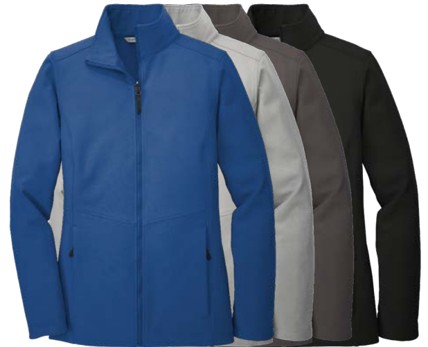
PORT AUTHORITY Ladies Collective Soft Shell Jacket L901 Women's Sizes: XS-4XL | 5 colors