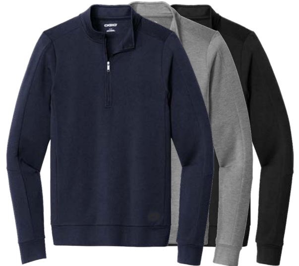
OGIO Luuma 1/2-Zip Fleece OG813 Adult Sizes: XS-4XL | 3 colors