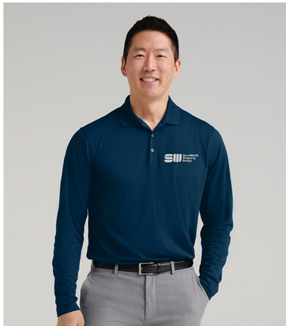
NIKE Dri-FIT Micro Pique 2.0 Long Sleeve Polo NKDC2104 Adult Sizes: XS-4XL | 7 colors