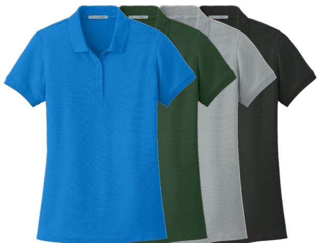
PORT AUTHORITY Ladies Core Classic Pique Polo L100 Women's Sizes: XS-6XL | 13 colors