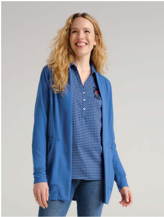
PORT AUTHORITY Ladies Microterry Cardigan LK825 Women's Sizes: XS-4XL | 4 colors Worn with LW680