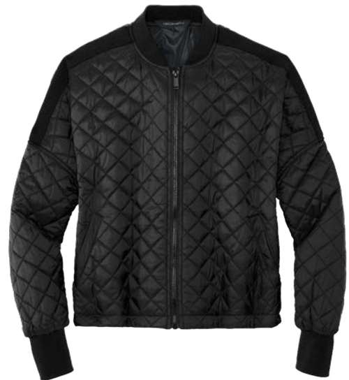
MERCER + METTLE Women's Boxy Quilted Jacket MM7201 Women's Sizes: XS-4XL | 1 color