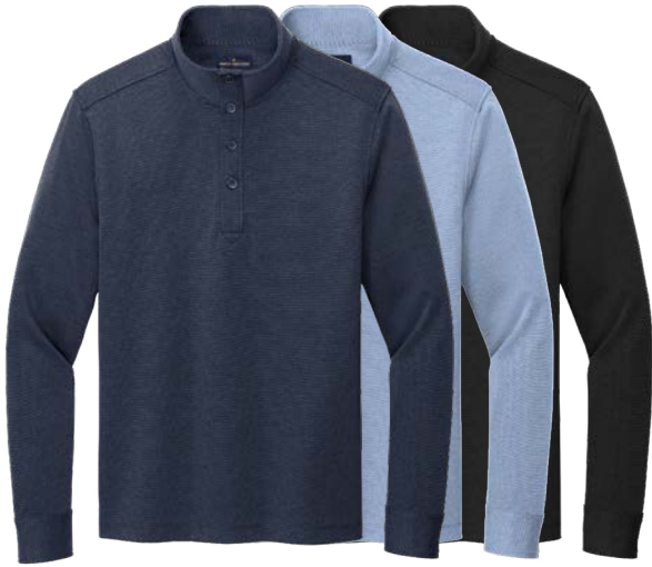
BROOKS BROTHERS Mid-Layer Stretch 1/2 Button BB18202 Adult Sizes: XS-4XL | 5 colors