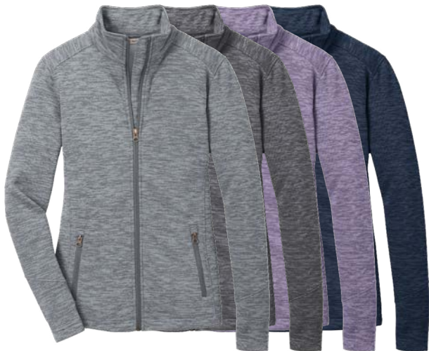
PORT AUTHORITY Ladies Digi Stripe Fleece Jacket L231 Women's Sizes: XS-4XL | 4 colors