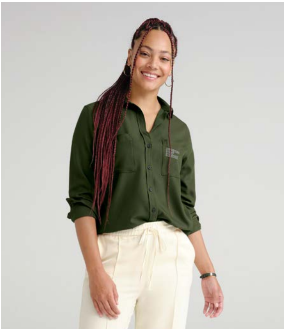
MERCER + METTLE Women's Stretch Crepe Long Sleeve Camp Blouse MM2013 Women's Sizes: XS-4XL | 4 colors