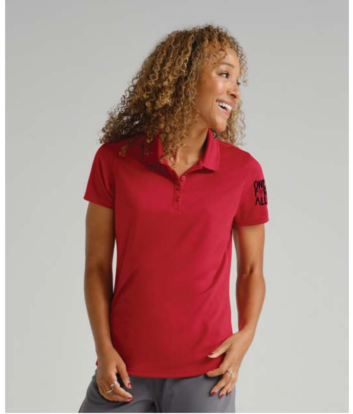
PORT AUTHORITY Ladies Dry Zone UV Micro-Mesh Polo LK110 Women's Sizes: XS-4XL | 16 colors