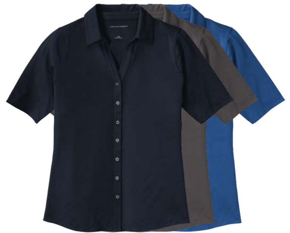
PORT AUTHORITY Ladies City Stretch Top LK682 Women's Sizes: XS-4XL | 5 colors