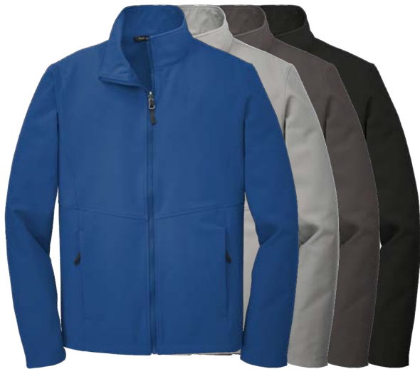
PORT AUTHORITY Collective Soft Shell Jacket J901 Adult Sizes: XS-4XL | 5 colors