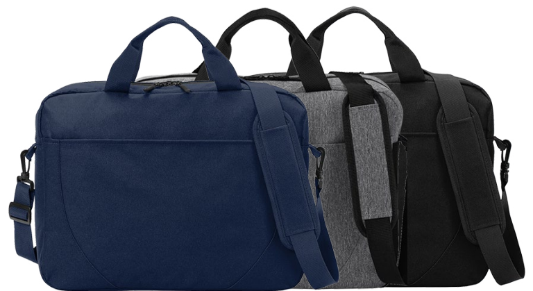
PORT AUTHORITY Access Briefcase BG318 3 colors