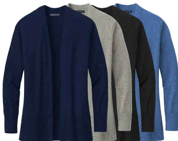
BROOKS BROTHERS Women's Cotton Stretch Long Cardigan Sweater BB18403 Women's Sizes: XS-4XL | 4 colors