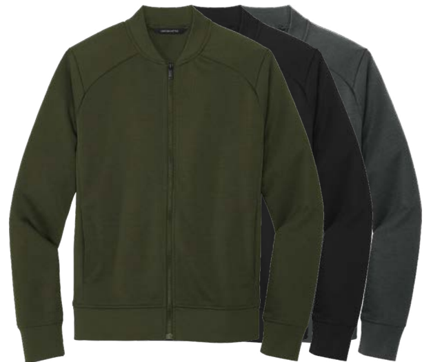
MERCER + METTLE Double-Knit Bomber MM3000 Adult Sizes: XS-4XL | 4 colors