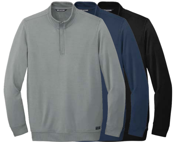
TRAVISMATHEW Newport 1/4-Zip Fleece TM1MU419 Adult Sizes: S-3XL | 3 colors