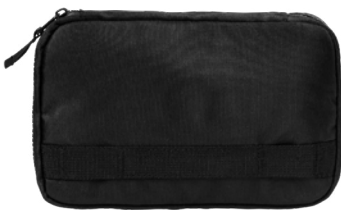
MERCER + METTLE Utility Case MMB700 1 color