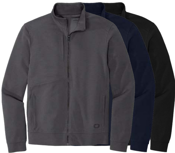
OGIO Hinge Full-Zip OG820 Adult Sizes: XS-4XL | 3 colors