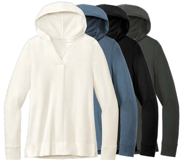
PORT AUTHORITY Ladies Microterry Pullover Hoodie LK826 Women's Sizes: XS-4XL | 4 colors