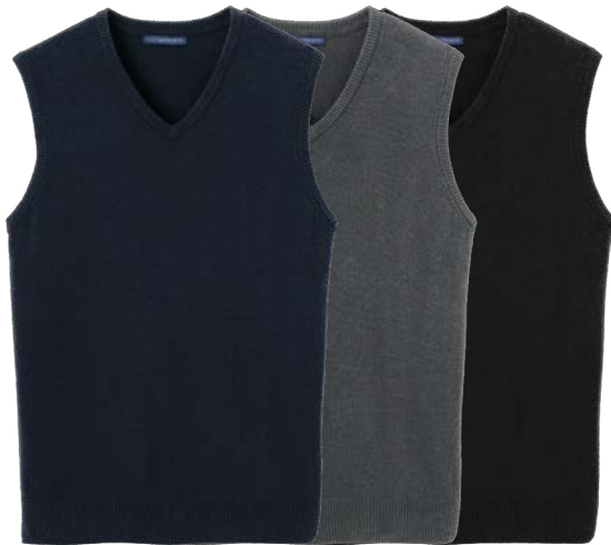
PORT AUTHORITY Sweater Vest SW286 Adult Sizes: XS-4XL | 3 colors