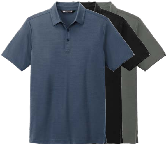
TRAVISMATHEW Bayfront Solid Polo TM1MY399 Adult Sizes: S-3XL | 4 colors