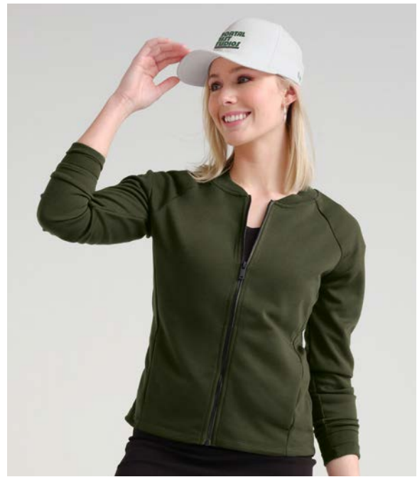
MERCER + METTLE Women's Double-Knit Bomber MM3001 Women's Sizes: XS-4XL | 4 colors Worn with TM1MU426

One size rarely fits all. A modern look represents a cohesive group that gives each member of the team the room to be themselves.