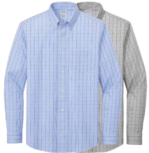
BROOKS BROTHERS Wrinkle Free Stretch Patterned Shirt BB18008 Adult Sizes: XS-4XL | 2 colors

Buttoned-up should not mean boring. A true classic look brings the team together with a sense of professionalism and pride.