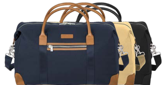
BROOKS BROTHERS Wells Duffel BB18880 3 colors

Heat Transfer is the most effective technique for these styles