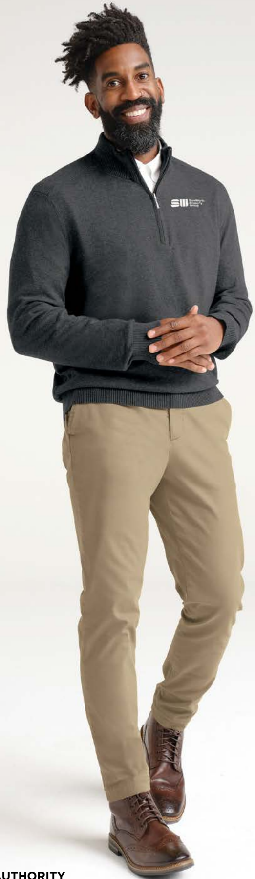
PORT AUTHORITY 1/2-Zip Sweater SW290 Adult Sizes: XS-4XL | 3 colors Worn with BB18002