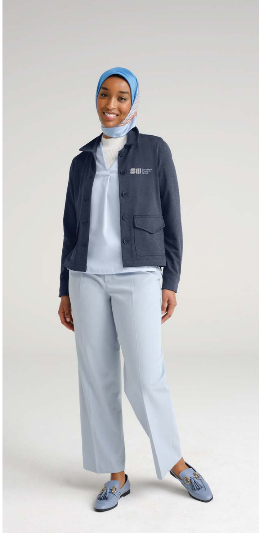
BROOKS BROTHERS Women's Mid-Layer Stretch Button Jacket BB18205 Women's Sizes: XS-4XL | 3 colors Worn with BB18009