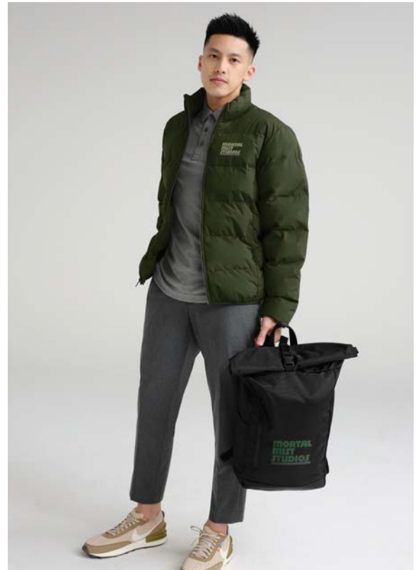
MERCER + METTLE Rucksack MMB201 One Size Fits All | 1 color Worn with TM1MU412, MM7210