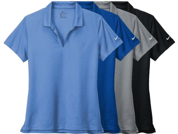
NIKE Ladies Dri-FIT Micro Pique 2.0 Polo NKDC1991 Women's Sizes: S-2XL | 20 colors