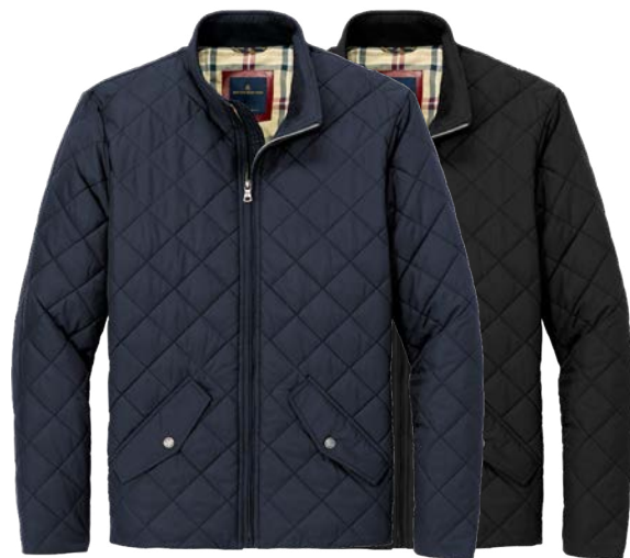
BROOKS BROTHERS Quilted Jacket BB18600 Adult Sizes: XS-4XL | 2 colors