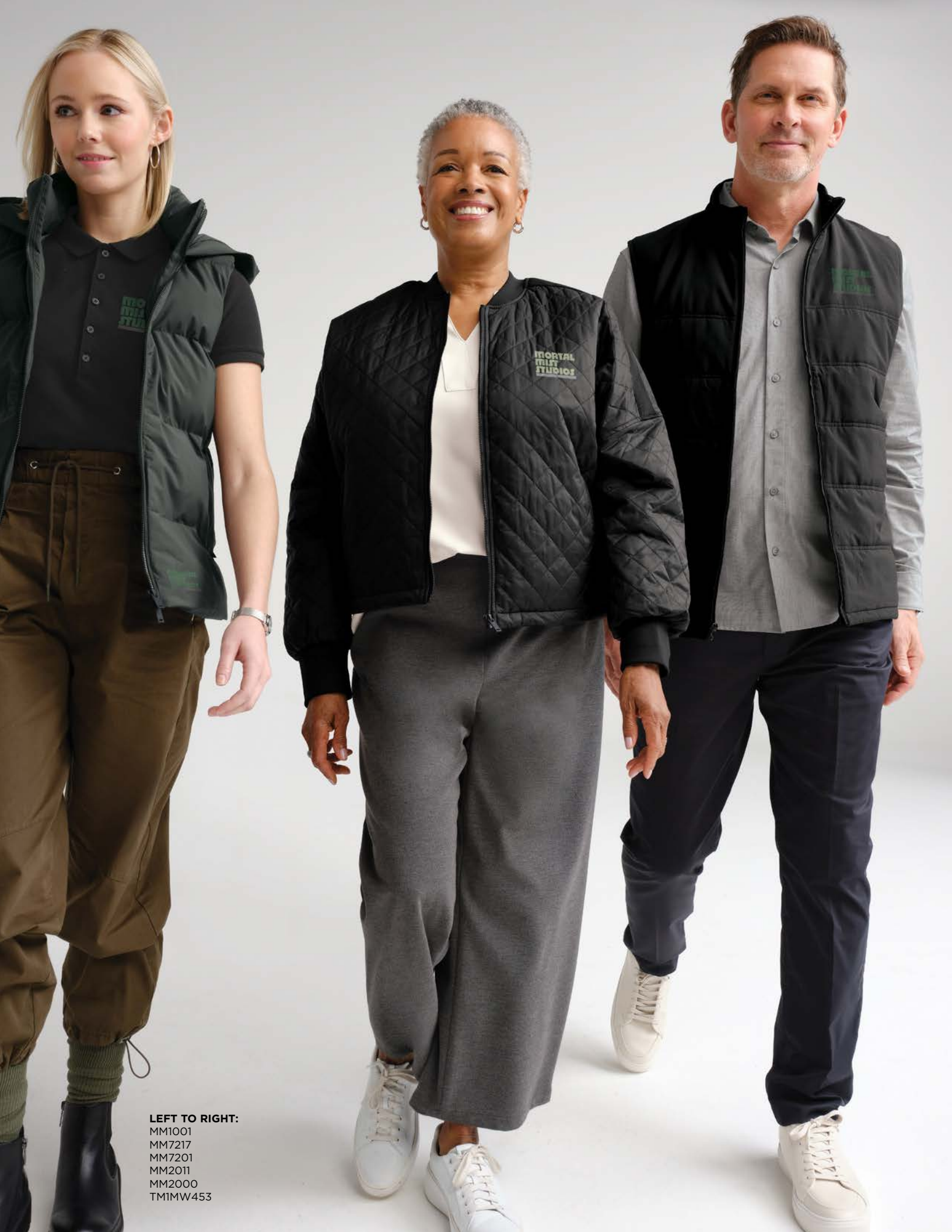
LEFT TO RIGHT: MM1001 MM7217 MM7201 MM2011 MM2000 TMIMW453