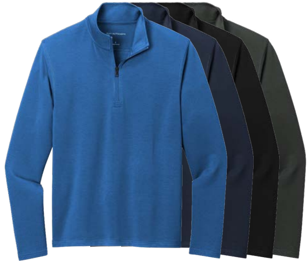
PORT AUTHORITY Microterry 1/4-Zip Pullover K825 Adult Sizes: XS-4XL | 4 colors