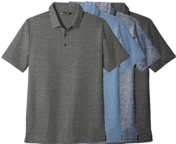
TRAVISMATHEW Oceanside Heather Polo TM1MU412 Adult Sizes: S-3XL | 8 colors