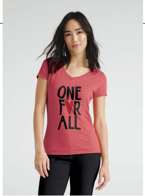
DISTRICT Women's Perfect Tri V-Neck Tee DM1350L Women's Sizes: XS-4XL | 23 colors