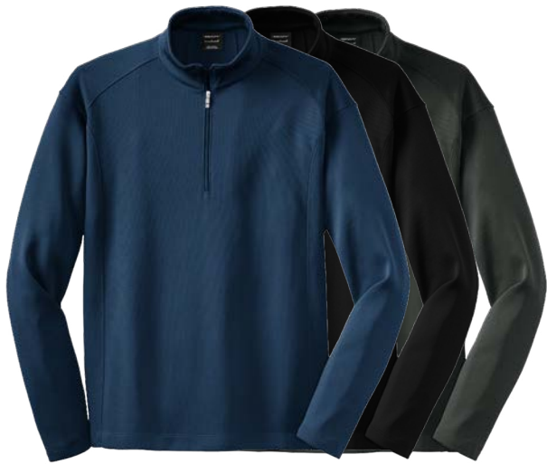
NIKE Sport Cover-Up 400099 Adult Sizes: XS-4XL | 3 colors