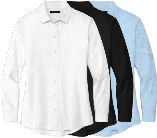
MERCER + METTLE Women's Long Sleeve Stretch Woven Shirt MM2001 Women's Sizes: XS-4XL | 4 colors