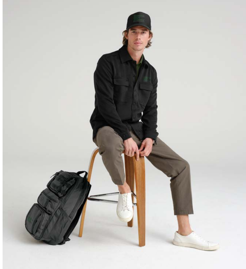
OGIO Utilitarian Modular Pack 91018 2 colors