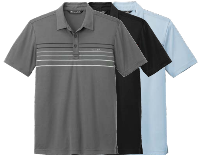
TRAVISMATHEW Coto Performance Chest Stripe Polo TM1MY400 Adult Sizes: S-3XL | 3 colors