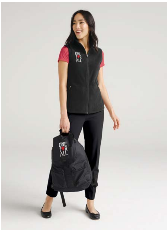
OGIO Evolution Pack 91015 4 colors