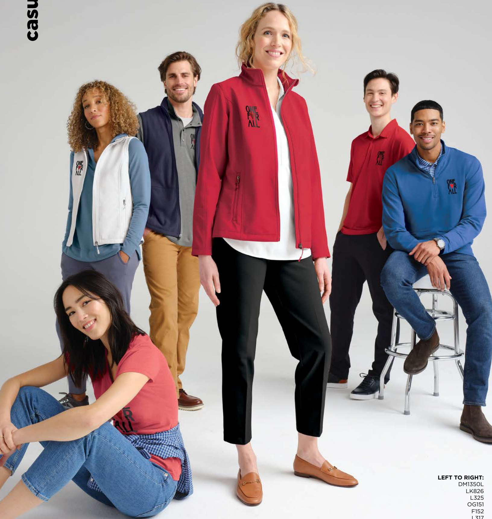
LEFT TO RIGHT: DM1350L LK826 L325 OG151 F152 L317 LW680 883681 K825 W680