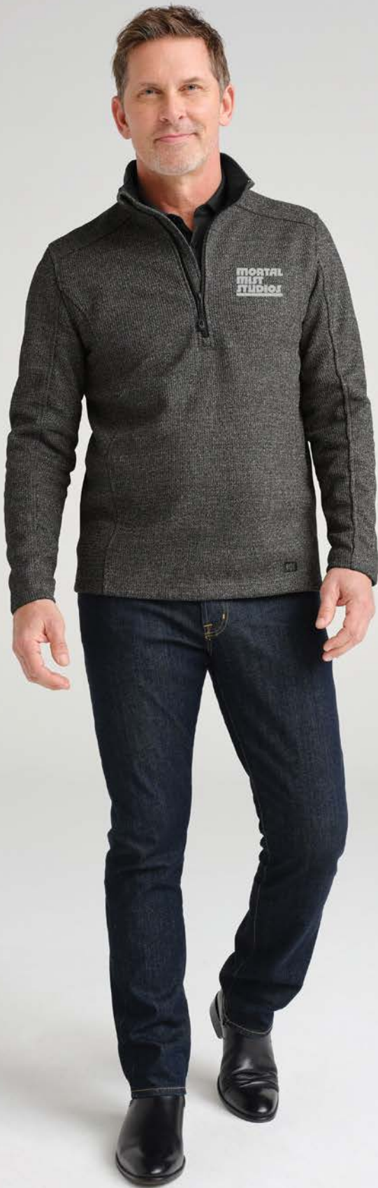
OGIO Grit Fleece 1/2-Zip OG729 Adult Sizes: XS-4XL | 2 colors Worn with TM1MY399