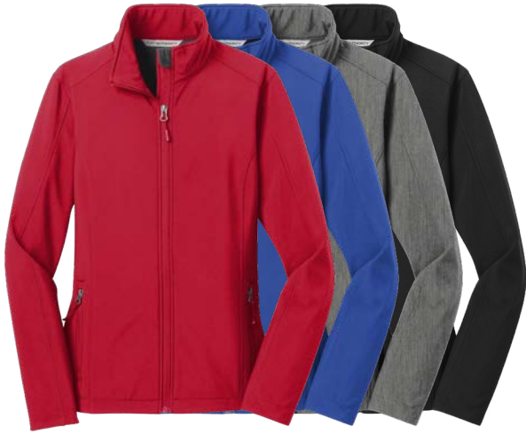
PORT AUTHORITY Ladies Core Soft Shell Jacket L317 Women's Sizes: XS-4XL | 10 colors