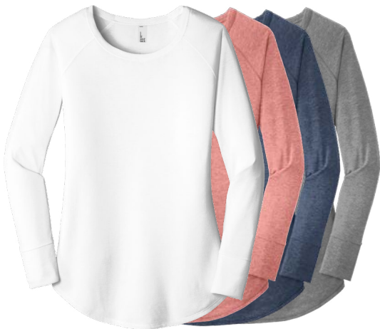
DISTRICT Women's Perfect Tri Long Sleeve Tunic Tee DT132L Women's Sizes: XS-4XL | 5 colors

Uplift the whole team with outfits that speak to a cohesive vision, a laid-back attitude and a clear focus on accomplishing great work together.