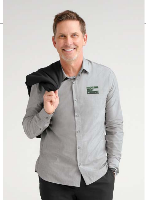
MERCER + METTLE Long Sleeve Stretch Woven Shirt MM2000 Adult Sizes: XS-4XL | 7 colors Worn with TM1MW453