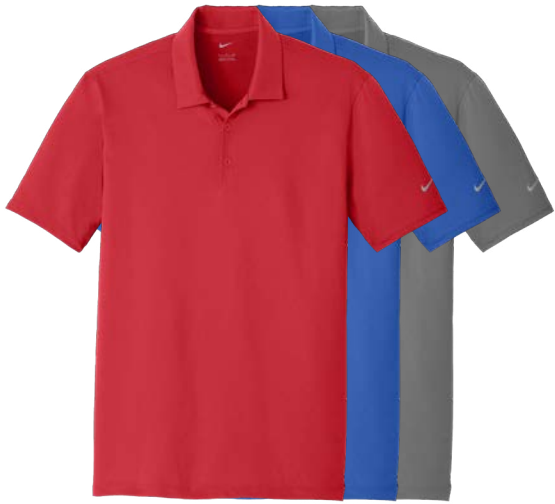
NIKE Dri-FIT Legacy Polo 883681 Adult Sizes: XS-4XL | 6 colors