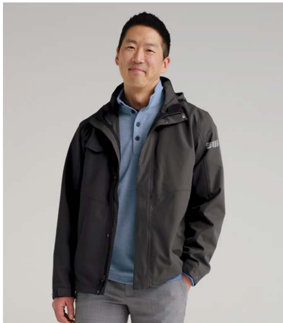
PORT AUTHORITY Collective Outer Shell Jacket J900 Adult Sizes: XS-4XL | 4 colors Worn with NKDC2104, BB18202